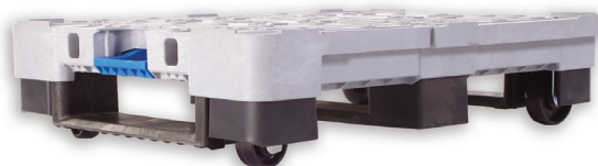
Pally, in dolly position