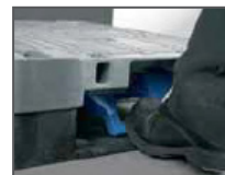
Dolly to pallet

One half pedal depression to release pallet bearers and engage castors with the ground