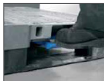
Pallet to dolly

One half pedal depression to release pallet bearers and engage castors with the ground