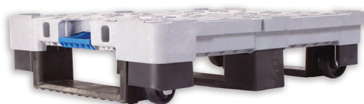
Pally, in pallet position